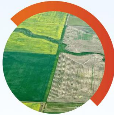
Land Acquisition through RTFCLARR Act, 2013