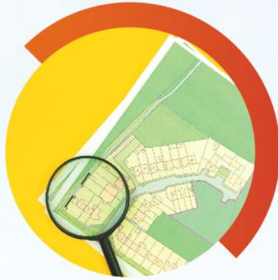
Land Audit and Inventory Management