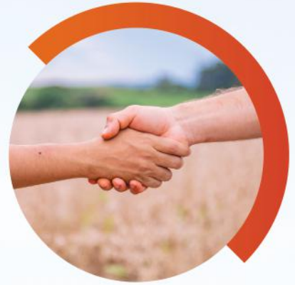
Direct Purchase of Land