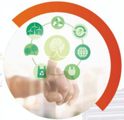
Environmental Impact Assessment