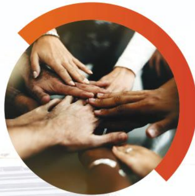
Social Impact Assessment