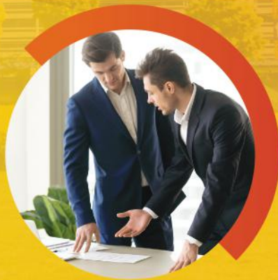
Environmental and Social Management Plan