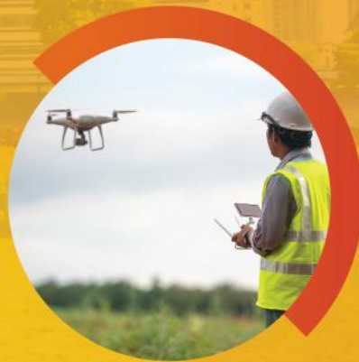
Drone and DGPS surveys of Land