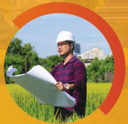
Implementation of Resettlement & Rehabilitation Action Plan (RAP)